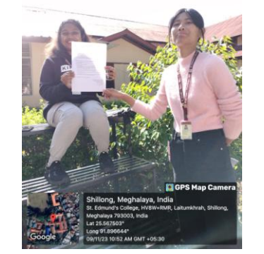
Shillong, Meghalaya, India St. Edmund's College, HVBW+RMR, Laitumkhrh, Shillong, Meghalaya 793003, India Lat 25.567604° Long 91.896654° 09/11/23 10:52 AM GMT +05:30