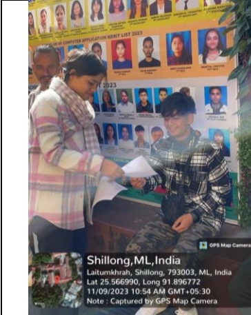
Shillong, ML, India Laitumkhrach, Shillong, 793003, ML, India Lat 25.566990, Long 91.896772 11/09/2023 10:54 AM GMT+05:30 Note: Captured by GPS Map Camera