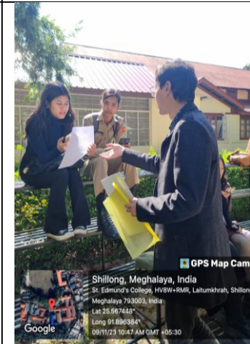
Shillong, Meghalaya, India St. Edmund's College, HVBW+RMR, Laitumkhrach, Shillong, Meghalaya 793003, India Lat 25.567448 Long 91.896384 09/11/23 10:47 AM GMT+05:30