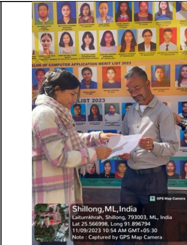
Shillong, ML, India Laitumkhrach, Shillong, 793003, ML, India Lat 25.566998, Long 91.896794 11/09/2023 10:54 AM GMT+05:30 Note: Captured by GPS Map Camera