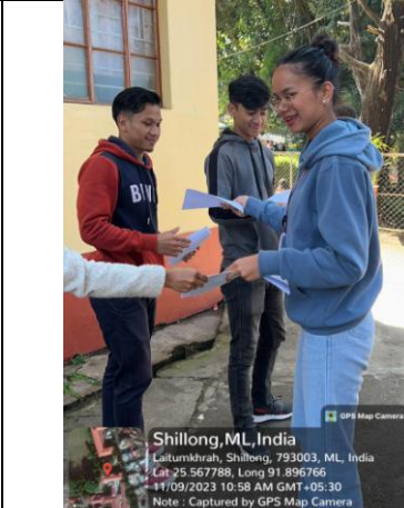
Shillong, ML, India Laitumkhrach, Shillong, 793003, ML, India Lat 25.567768, Long 91.896766 11/09/2023 10:58 AM GMT+05:30 Note: Captured by GPS Map Camera