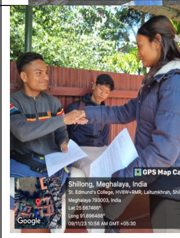
Shillong, Meghalaya, India St. Edmund's College, HVBW+RMR, Laitumkhrach, Shillong, Meghalaya 793003, India Lat 25.567466 Long 91.896488 09/11/23 10:58 AM GMT+05:30