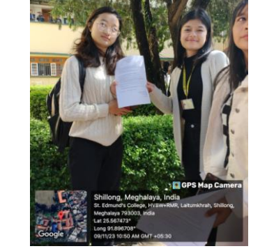
Shillong, Meghalaya, India St. Edmund's College, HVBW+RMR, Laitumkhrh, Shillong, Meghalaya 793003, India Lat 25.567473° Long 91.896708° 09/11/23 10:50 AM GMT +05:30