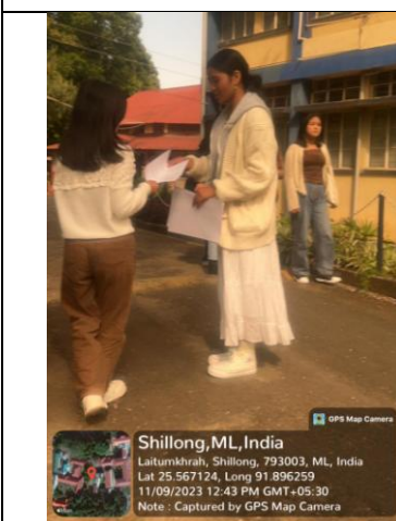
Shillong, ML, India Laitumkhrach, Shillong, 793003, ML, India Lat 25.567124, Long 91.896259 11/09/2023 12:43 PM GMT+05:30 Note: Captured by GPS Map Camera