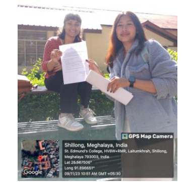
Shillong, Meghalaya, India St. Edmund's College, HVBW+RMR, Laitumkhrh, Shillong, Meghalaya 793003, India Lat 25.567904° Long 91.896661° 09/11/23 10:51 AM GMT +05:30