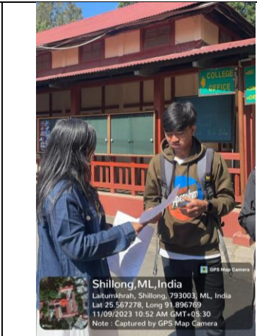
Shillong, ML, India Laitumkhrach, Shillong, 793003, ML, India Lat 25.567278, Long 91.896769 11/09/2023 10:52 AM GMT+05:30 Note: Captured by GPS Map Camera