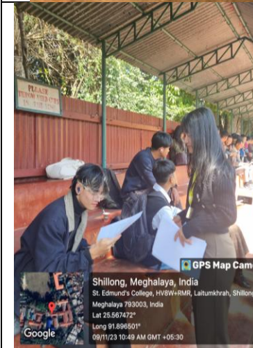
Shillong, Meghalaya, India St. Edmund's College, HVBW+RMR, Laitumkhrach, Shillong, Meghalaya 793003, India Lat 25.567472 Long 91.896501 09/11/23 10:49 AM GMT+05:30