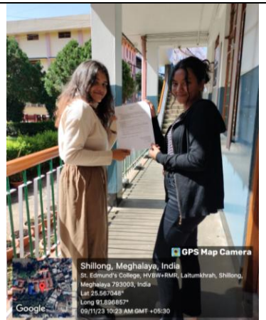
Shillong, Meghalaya, India St. Edmund's College, HVBW+RMR, Laitumkhrh, Shillong, Meghalaya 793003, India Lat 25.567048° Long 91.896897° 09/11/23 10:52 AM GMT +05:30