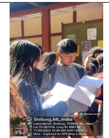
Shillong, ML, India Laitumkhrh, Shillong, 793003, ML, India Lat 25.567418, Long 91.896736° 11/09/2023 10:49 AM GMT +05:30 Note: Captured by GPS Map Camera