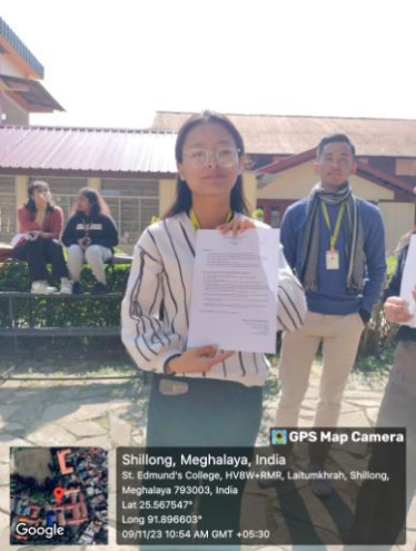
Shillong, Meghalaya, India St. Edmund's College, HVBW+RMR, Laitumkhrh, Shillong, Meghalaya 793003, India Lat 25.567247° Long 91.896603° 09/11/23 10:54 AM GMT +05:30