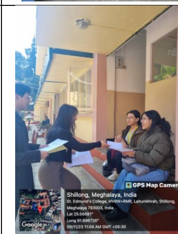
Shillong, Meghalaya, India St. Edmund's College, HVBW+RMR, Laitumkhrach, Shillong, Meghalaya 793003, India Lat 25.566811 Long 91.896728 09/11/23 11:04 AM GMT+05:30