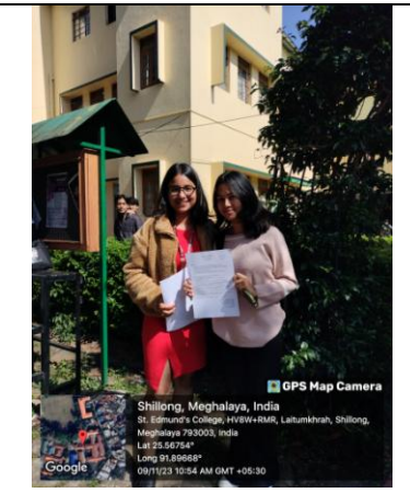
Shillong, Meghalaya, India St. Edmund's College, HVBW+RMR, Laitumkhrh, Shillong, Meghalaya 793003, India Lat 25.56754° Long 91.89686° 09/11/23 10:54 AM GMT +05:30