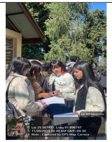
Lat 25.567437, Long 91.896747 11/09/2023 10:49 AM GMT +05:30 Note: Captured by GPS Map Camera