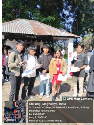
Shillong, Meghalaya, India St. Edmund's College, HVBW+RMR, Laitumkhrh, Shillong, Meghalaya 793003, India Lat 25.567837° Long 91.896614° 09/11/23 10:53 AM GMT +05:30