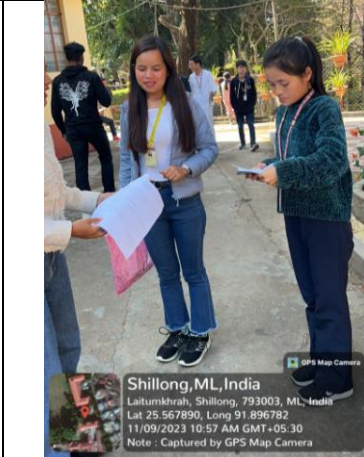
Shillong, ML, India Laitumkhrach, Shillong, 793003, ML, India Lat 25.567890, Long 91.896782 11/09/2023 10:57 AM GMT+05:30 Note: Captured by GPS Map Camera