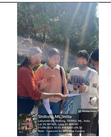
Shillong, ML, India Laitumkhrh, Shillong, 793003, ML, India Lat 25.567305, Long 91.896741° 11/09/2023 10:51 AM GMT +05:30 Note: Captured by GPS Map Camera