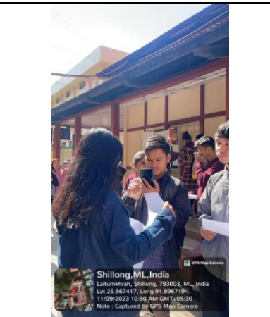
Shillong, ML, India Laitumkhrh, Shillong, 793003, ML, India Lat 25.567417, Long 91.896710° 11/09/2023 10:50 AM GMT +05:30 Note: Captured by GPS Map Camera