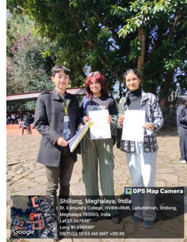
Shillong, Meghalaya, India St. Edmund's College, HVBW+RMR, Laitumkhrh, Shillong, Meghalaya 793003, India Lat 25.567849° Long 91.896599° 09/11/23 10:53 AM GMT +05:30