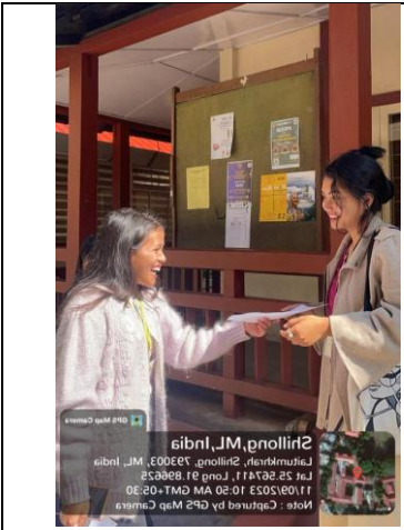
Shillong, ML, India Laitumkhrach, Shillong, 793003, ML, India Lat 25.566990, Long 91.896772 11/09/2023 10:50:01 AM GMT+05:30